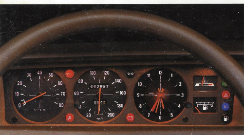
INSTRUMENT PANEL , with speedometer, tachometer and electric clock set behind anti-reflective glass. Warning lights, including those for brake condition, lights and indicators are grouped around the circular dials, designed to be read in a single, swift glance.