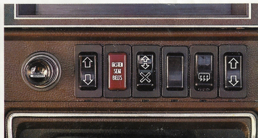
CENTRE CONSOLE , with cigarette lighter and finger tip controls for electrically operated windows.