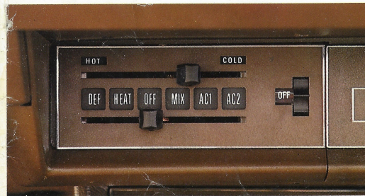
Air-conditioning control panel.